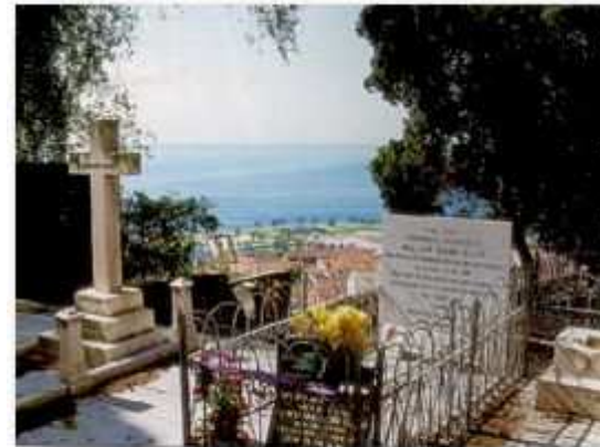
The gravesite of William Webb Ellis